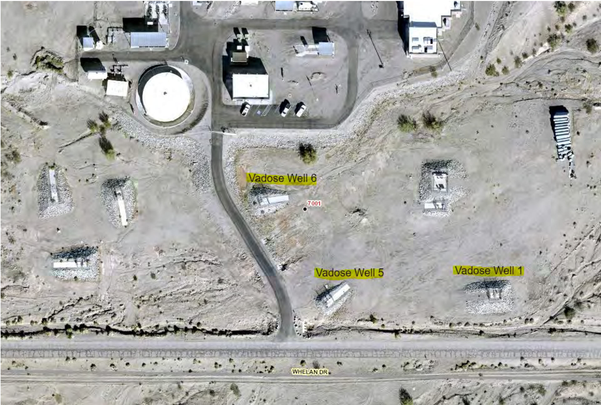
LOCATION OF VADOSE WELLS