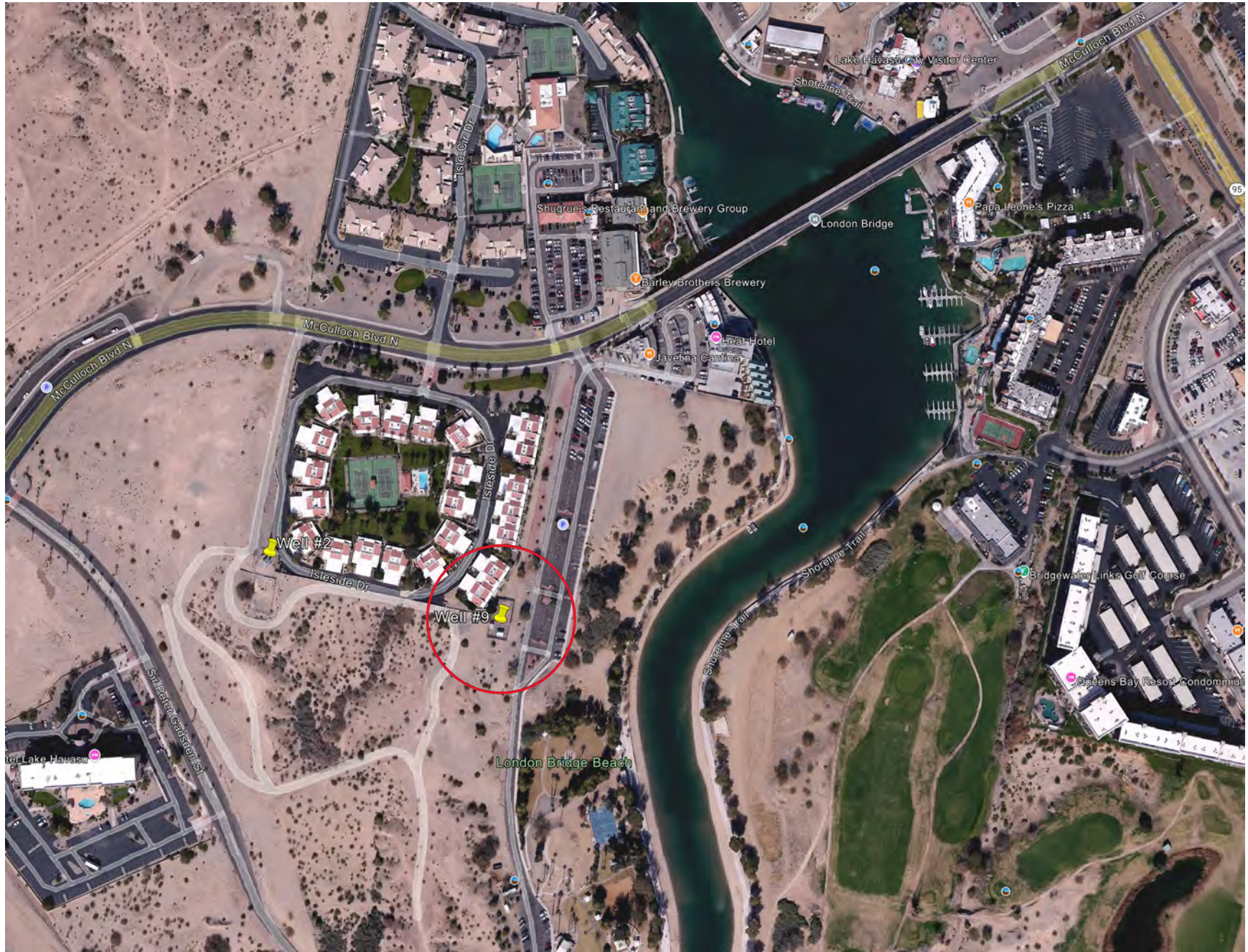
WELL 9 LOCATION