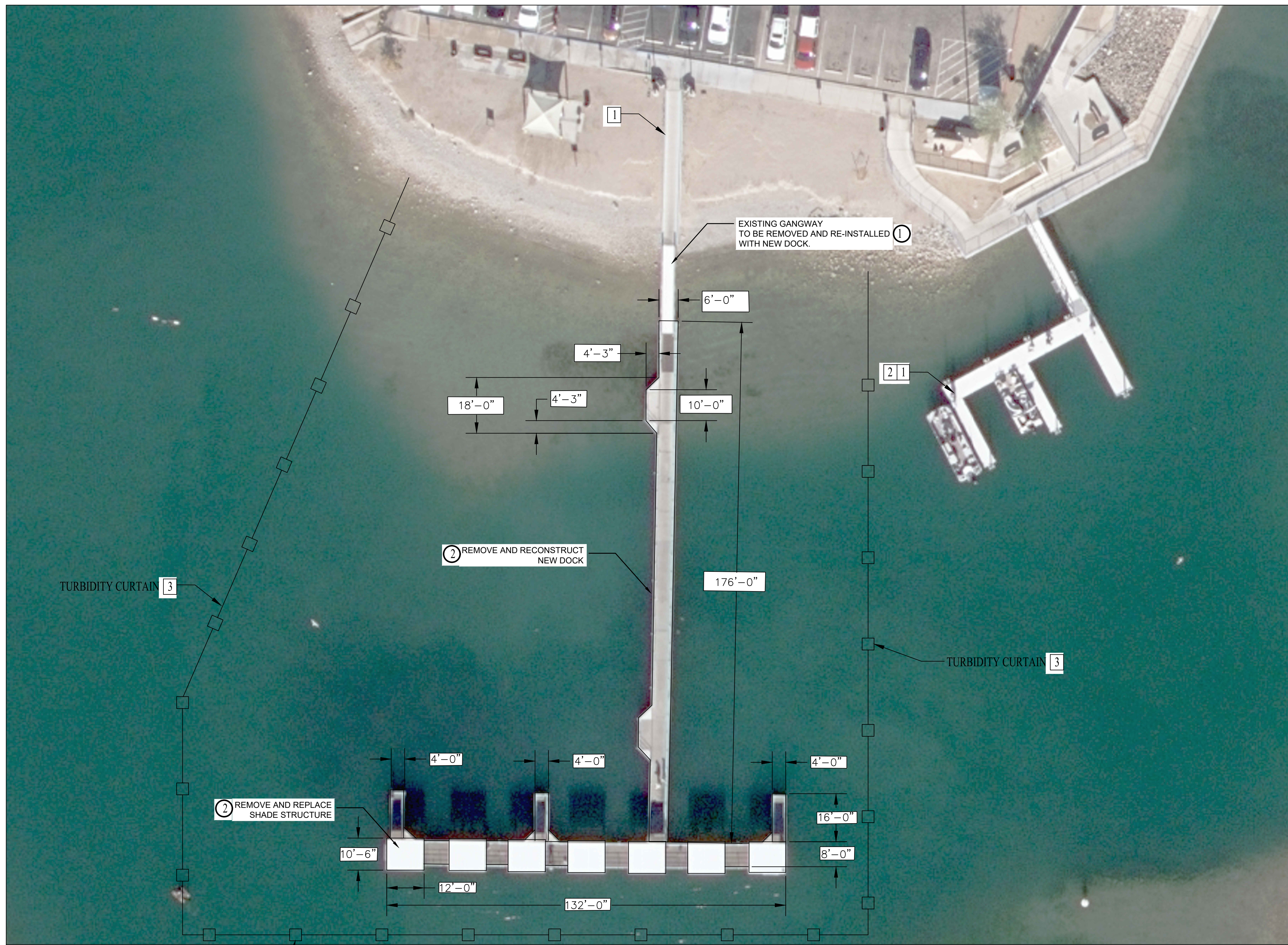
SITE SIX FISHING DOCK REPLACEMENT SCALE 1"=20'